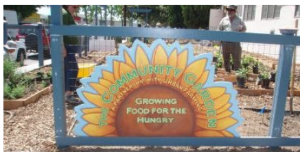
The Community Garden At Holy Nativity

At the Community Garden at Holy Nativity, we understand that in tough economic times -- and in these times of massive societal change brought on by peak oil and global warming -- food security is vital to community stability. During World War II over 40% of our nation's produce was grown in home gardens. Our society has forgotten these skills. At the Community Garden at Holy Nativity, we're growing far more than a few vegetables: we're growing a local skill base, and we're growing an interconnected community. Come join us!